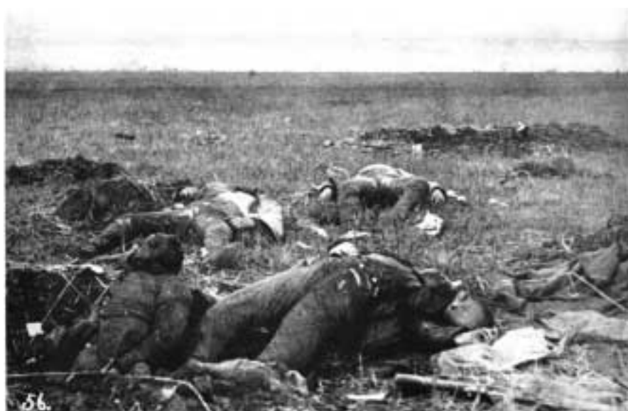
FIELD OF GLORY